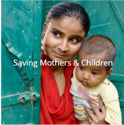
Saving Mothers & Children