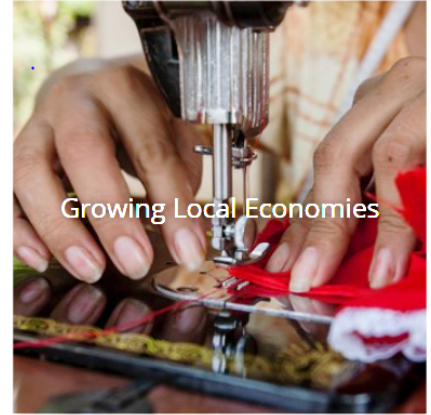
Growing Local Economies

For more details, please visit www.rotary.org The members of Rotary are: